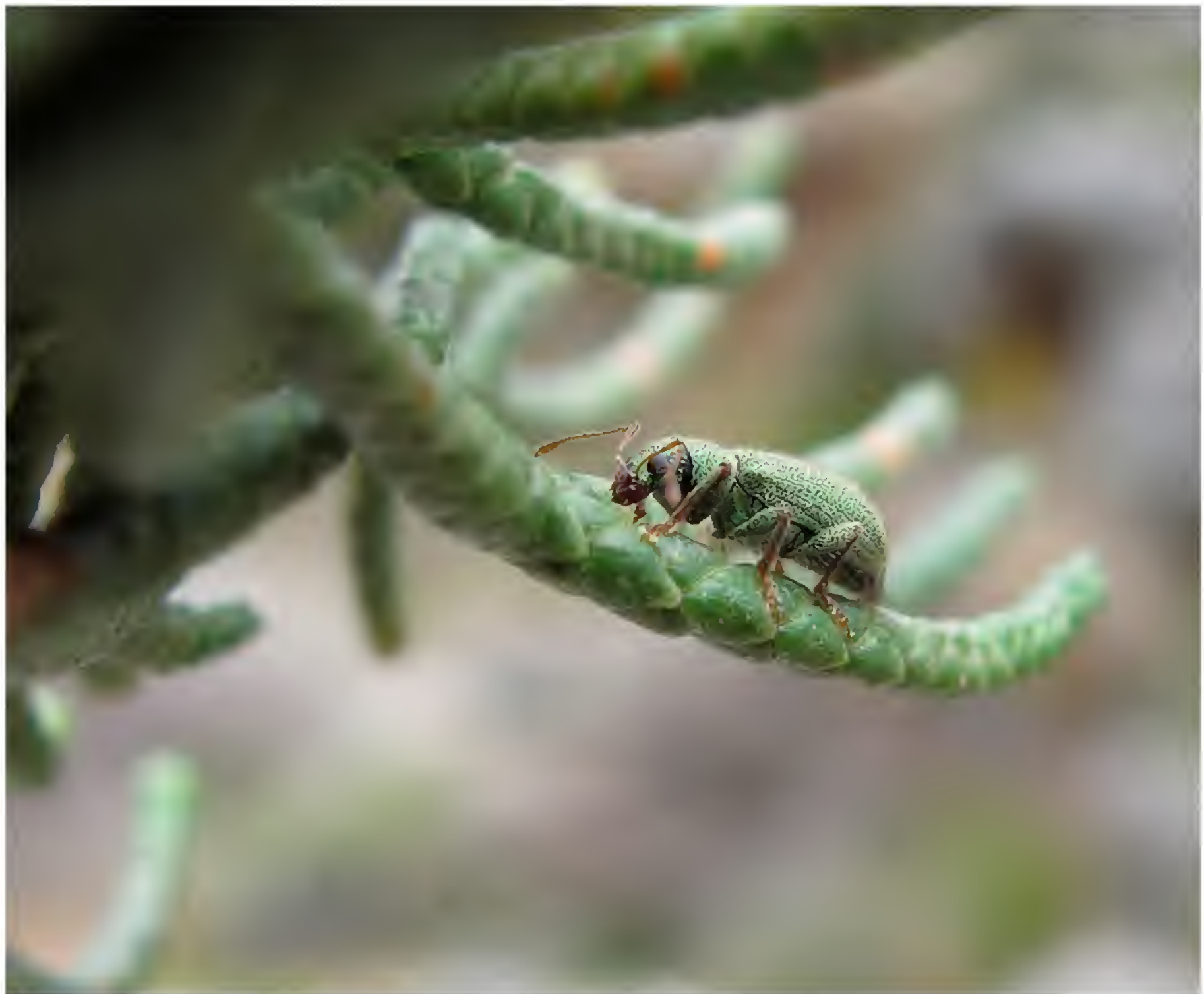
Fig. 5. Dichorrhinus creticus in April on Cupressus sempervirens , Chora Sfakion, 140 m a. s. l., Crete Island, Greece.

Alonso-Zarazaga M.A. & Lyal C.H.C. 1999. A World Catalogue of Families and Genera of Curculionoidea (Insecta: Coleoptera). (Excepting Scolytidae and Platypodidae) . Entomopraxis, Barcelona.